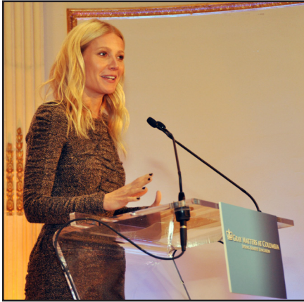
Gray Matters at Columbia 2012 honoree Gwyneth Paltrow

On April 25, 2012, Academy Award-winning actress Gwyneth Paltrow was honored at the annual Gray Matters at Columbia Spring Benefit Luncheon for raising awareness about postpartum depression and women’s mental health.