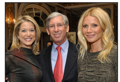
Paula Zahn, Jeffrey Lieberman, Gwyneth Paltrow