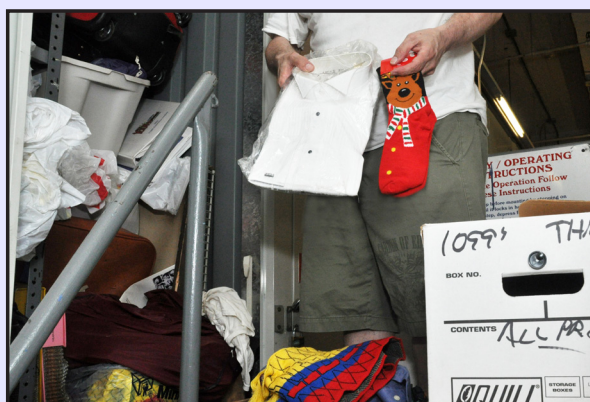
Accumulated clutter... the result of hoarding behavior.

In 2010, due to worries about being evicted, Drew sought help from a not-for-profit community eviction prevention program in Manhattan called Eviction Intervention